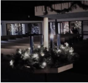
Advent December 4