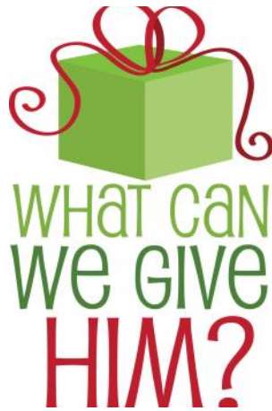
Advent December 11 SS program 11:15

give him the name JESUS , because he WILL SAVE HIS PEOPLE from their sins.